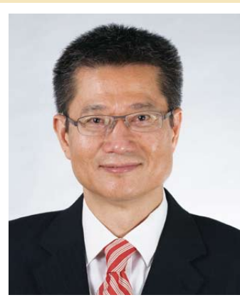
主席陳茂波太平紳士

Mr Paul Chan is a member of the Legislative Council of the Hong Kong Special Administrative Region. He is an accountant by profession and is a former President of the Hong Kong Institute of Certified Public Accountants and the Association of Chartered Certified Accountants – Hong Kong. He is the Chairman of Crowe Horwath (HK) CPA Limited. Mr Chan has served on many boards and committees of governmental and public bodies such as the West Kowloon Cultural District Authority and the Strategic Development Commission. Mr Chan holds an MBA degree from the Chinese University of Hong Kong and has also studied at the Harvard Business School. He has frequently lectured, on a visiting basis, for universities, chambers of commerce, newspapers and professional institutions.